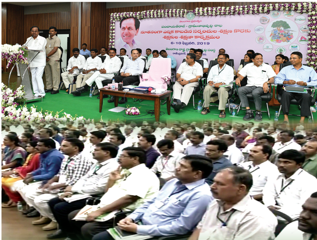
Hon'ble Chief Minister Sri K. Chandrashekar Rao addressing the MoTs of Sarpanches' Training Programme