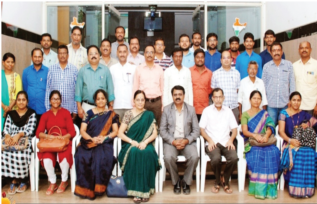
Training programme on Disaster Management with Spl. Reference to Telangana State