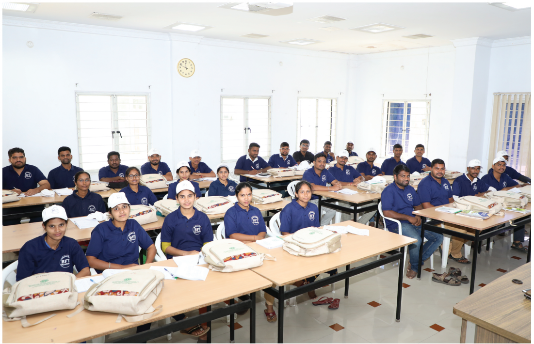
Batch of Barefoot Technicians undergoing Training at TSIRD