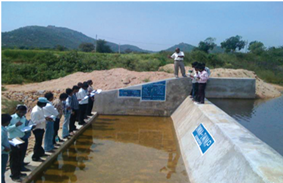
Worksite verification of check dam by social audit team