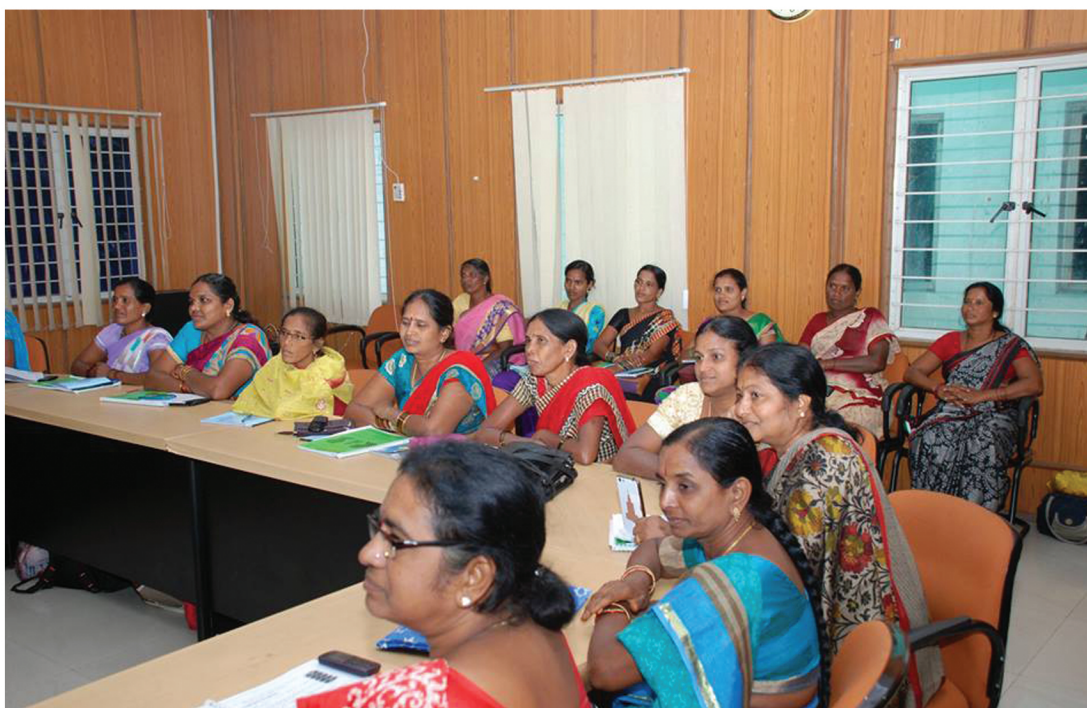
Participants attended for the Training on Prevention of Sexual Harassment on Women at Work Place