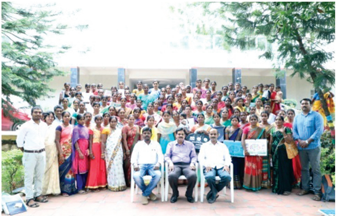
A batch of PASHUMITRA 5 day Training Programme organized by SERP at TSIRD