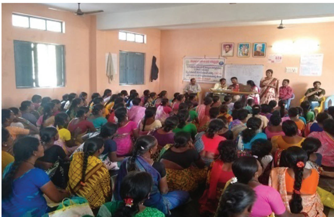
Off-Campus training programme on Swachh Bharat Mission (G)