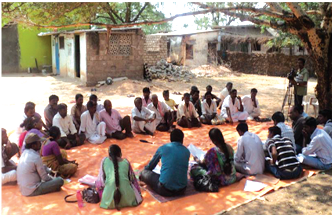
Social Audit SRPs participating in Gram Sabha