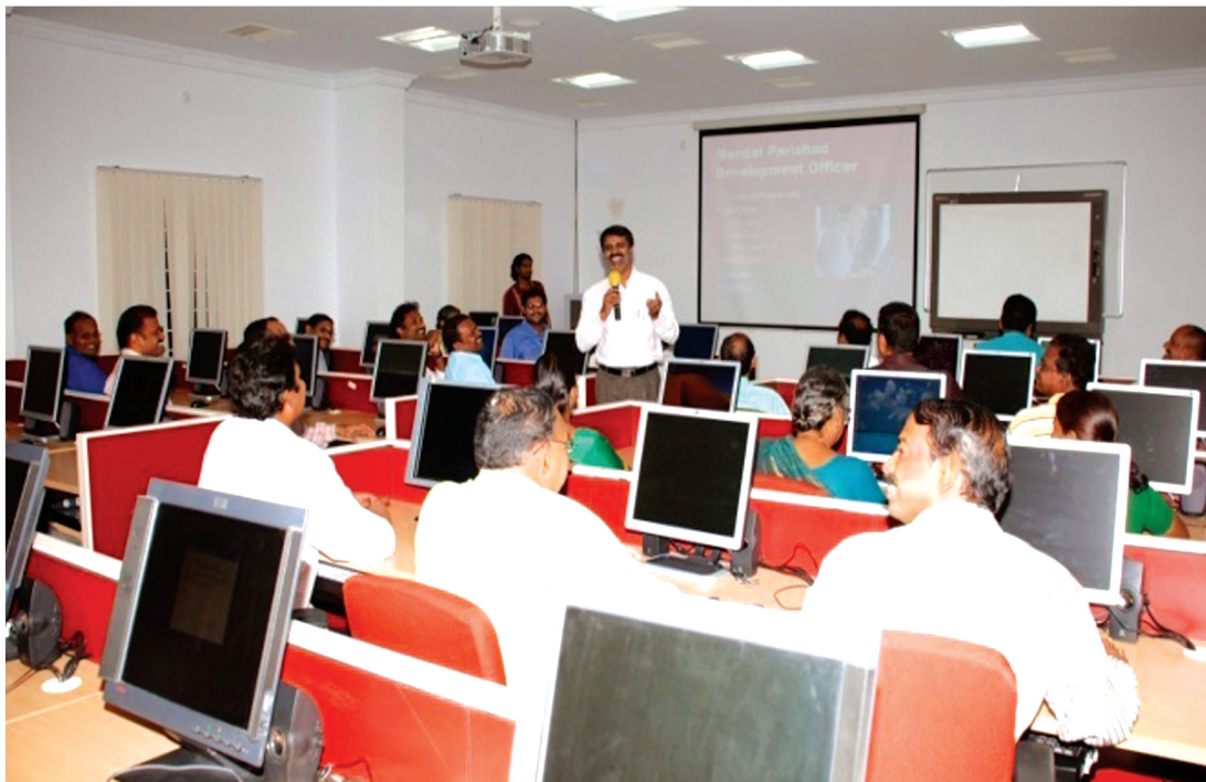
Participants undergoing training in computer lab on ICT skills