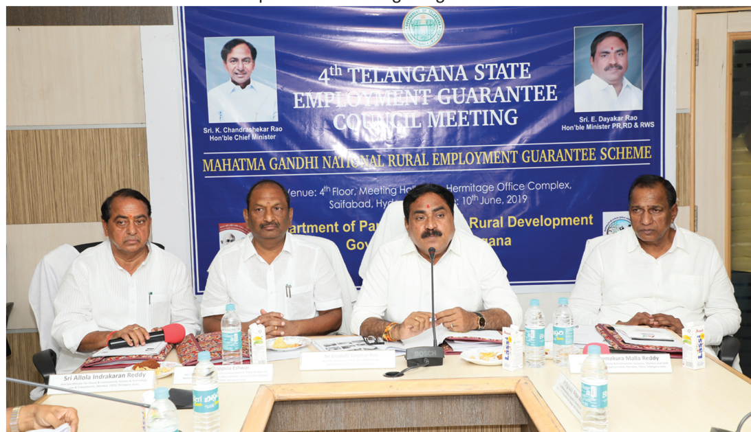
Hon'ble Minister for Panchayat Raj & Rural Development Sri E. Dayakar Rao addressing in the employment Guarantee council meeting of Telangana State