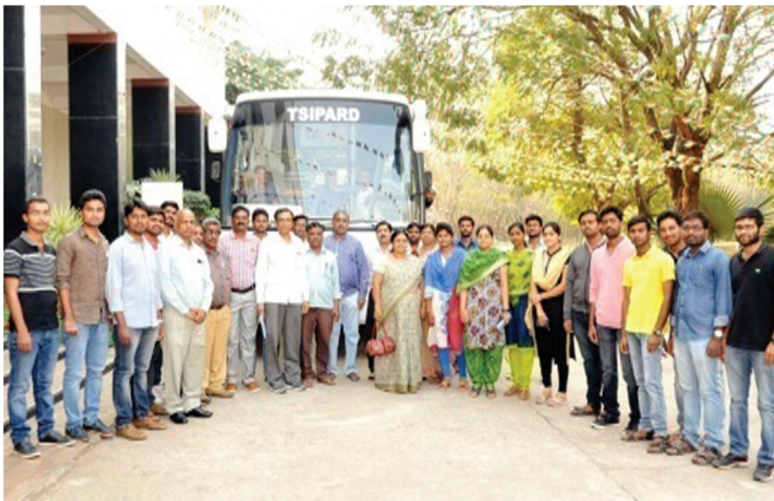
Exposure visit of P.R. Engineers on Best Practices to Tamilnadu State